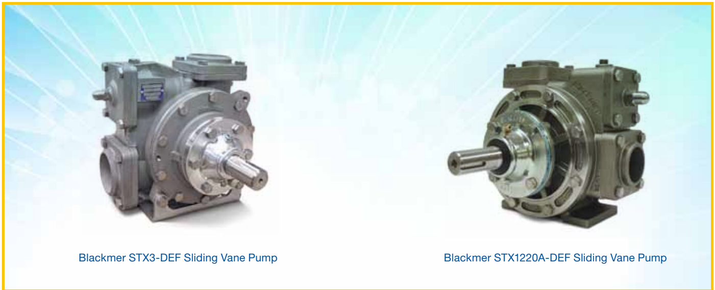
Blackmer STX3-DEF Sliding Vane Pump