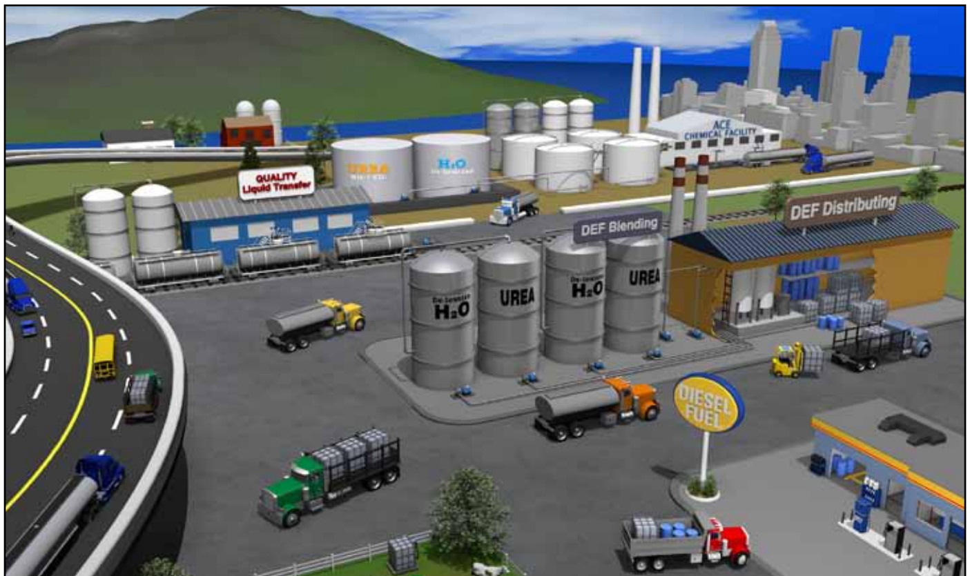
The many loading, unloading and transfer points along the Diesel Exhaust Fluid (DEF) production and supply chain are ideal for Blackmer's new DEF Sliding Vane Pumps.

When the manufacturers of diesel-powered vehicles were looking for ways to make their vehicles compliant with the new emission-control regulations, they turned their gaze to Europe, where similar measures had been in place since the early 1990s. One of the most popular ways to control NOx emissions on European diesel vehicles was through the use of Diesel Exhaust Fluid (DEF), or as it was originally known in Europe, Aqueous Urea Solution 32 (AUS 32), which is a urea-based chemical reactant consisting of 32.5% urea and 67.5% deionized water that is injected into the vehicle's exhaust stream. The most common process for this injection is called Selective